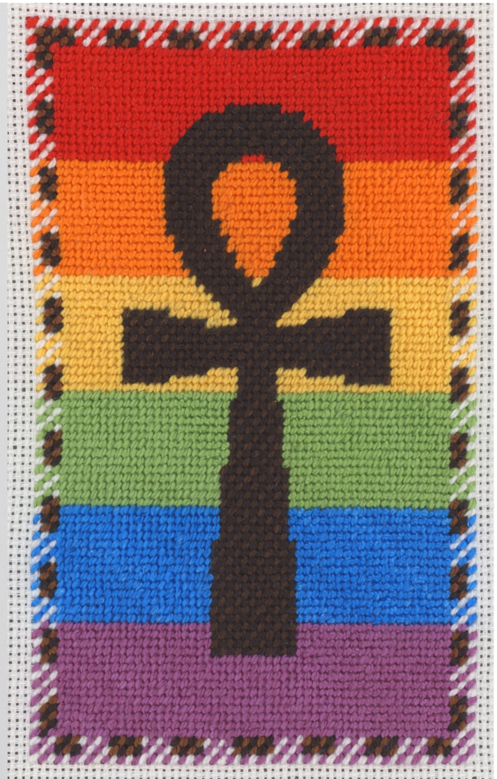
Cross stitch on left, needlepoint on right.